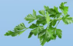
LEVISTICUM OFFICINALE LOVAGE