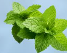
LEVISTICUM OFFICINALE LOVAGE